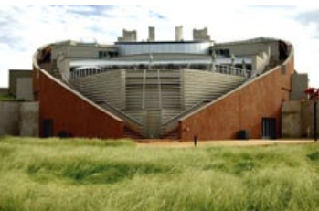
Maropeng, Cradle of Humankind

ready access to road, rail and air connections to all of South Africa and the region, nearly a third of all South African exports move through it. Upgrade and expanding the facility to move it to the cutting edge of the logistics industry creates opportunities for manufacturers of time-sensitive products as well as logistics, freight and transport