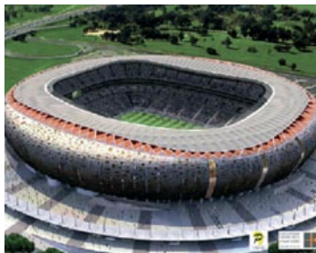
Soccer City Stadium

country to see their favourite team. Estimates of the economic impact are as high as R20 billion and as many as 160,000 jobs could be created. Demand for construction material is already causing prices for cement and other basic materials to sky rocket.