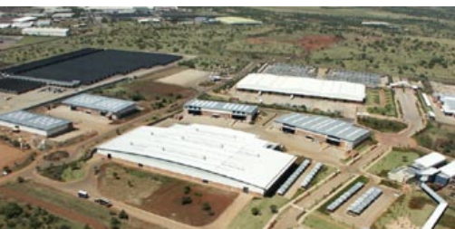
Automotive Supplier Park

so as to enhance the efficiency of the supply chain in a fast growing industry with substantial potential for further growth to meet expanding domestic and export demand.