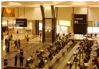
OR Tambo Airport

The OR Tambo International Airport, as the former Johannesburg International is now known, is already the busiest, most modern and most efficient passenger and freight hub in southern Africa. The purpose of the IDZ project is to make it even better. The envisaged IDZ will provide an efficient import and export duty free zone for high value-added, light manufactured