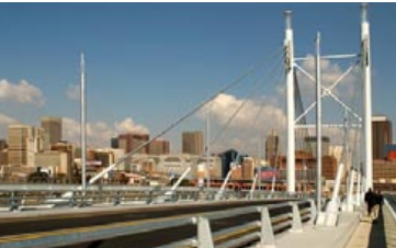
Nelson Mandela bridge

Fortunately for the potential investor, Gauteng offers countless opportunities for direct investment across the business map. And,